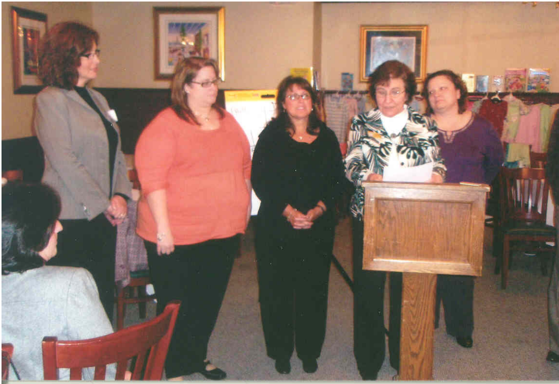
Installation of new members at the November meeting